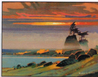
Rolling Fog at Dare Beach on the West Coast Trail

12" x 16" acrylic, canvas Robert Genn, Surrey, BC rgenn@saraphina.com