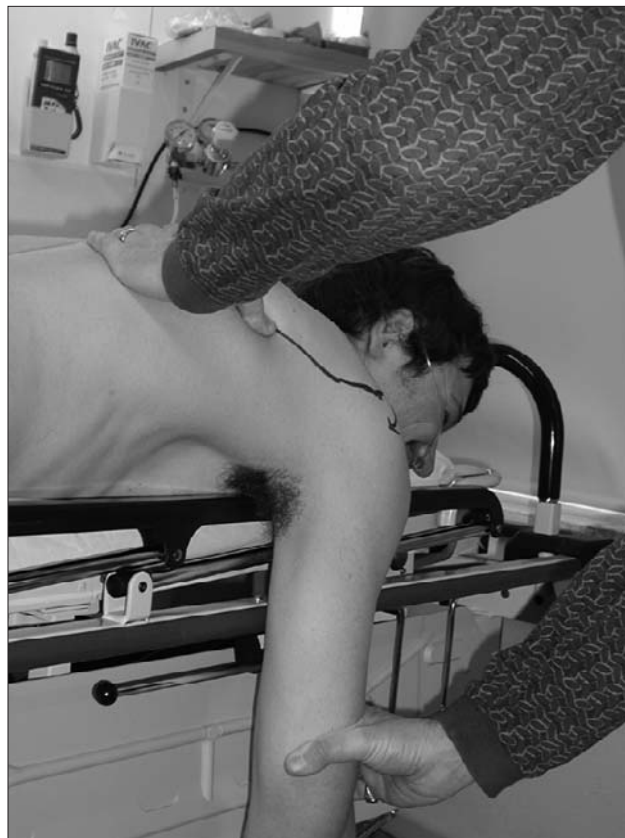
Fig. 12. Scapular rotation method may be accompanied by traction of the arm.

Scapular rotation can be combined with active traction by a sole clinician or by an assistant (Fig. 12).