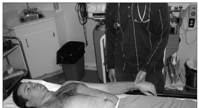
Fig. 17. Initial position of the Spaso method. The physician grasps the patient's wrist.

The physician grasps the patient's wrist and with gentle traction, slowly raises the arm to 90 degrees (Fig. 17).