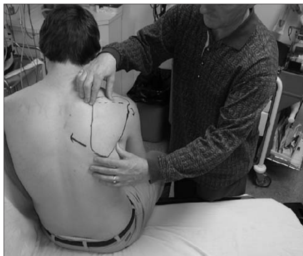
Fig. 13. Scapular rotation performed in a seated position with the bed at 90 degrees.

Scapular rotation can also be performed in the seated position with the bed at 90 degrees (Fig. 13).