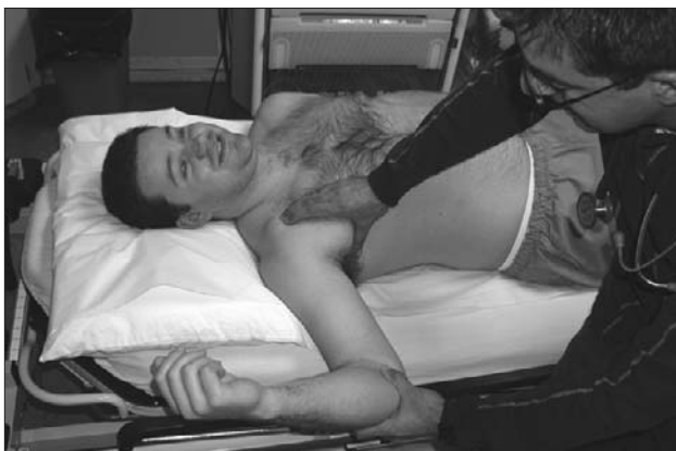
Fig. 15. The physician stabilizes the humeral head as part of the Milch method.

The physician firmly places his or her hand on the affected shoulder and stabilizes the humeral head with his or her thumb so it does not move inferiorly when the arm is abducted (Fig. 15).