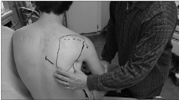
Fig. 14. Scapular rotation method in which the physician applies downward traction to the patient's arm.

This method can be performed with or without downward humeral traction (Fig. 14).