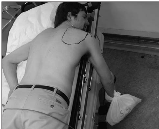
Fig. 10. Stimson's method in which a 5 kg weight is attached to the patient's arm (the patient should not hold the weight).

tion of the patient's airway and may not be useful in the inebriated or sedated patient. The Stimson method can be combined with scapular rotation 5,15 (Fig. 10).