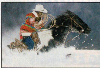
Northern Passage Acrylic on canvas, 20" x 30" © Carl Shinkaruk