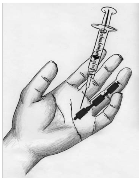
Fig. 1. Illustration of a trigger finger showing the narrowing of the synovial sheath below the A1 pulley.

In many cases, rest and avoidance of gripping activities will alleviate symptoms. Nonsteroidal anti-inflammatory drugs can be used to reduce swelling and pain. Splinting of the distal interphalangeal (DIP) joint with the proximal interphalangeal (PIP) joint left mobile can also be used. 3,4 In this technique, a sandwich composed of 2 layers of Coban wrap (Emergency Medical Products Inc.) enclosing a paper clip is placed on the dorsal aspect of the DIP.