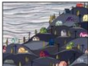
Houses on Hills Gouache on paper, 29" x 21", by Miyuki Kondo © 2007 www.miyukikondo.com