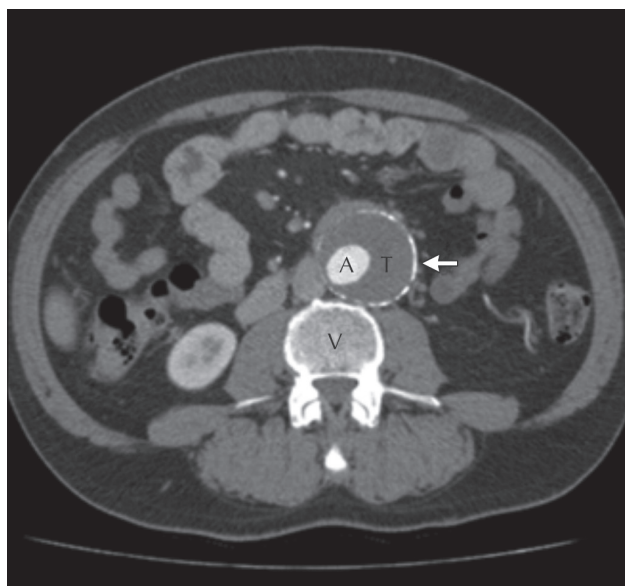
Fig. 2. Transverse view of the abdominal computed tomography scan with contrast showing a 5.1-cm abdominal aortic aneurysm with calcification of the aneurysmal wall (arrow). A circumferential thrombus has formed (T) within the aneurysmal sac adjacent to the abdominal aorta (A). A vertebral body can also be seen (V).