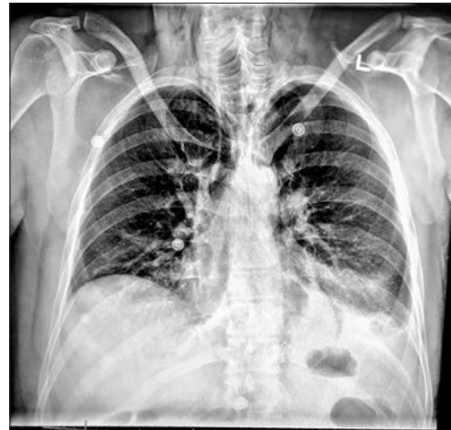
Figure 1: Chest radiography demonstrating an extensive pneumomediastinum and a small left-sided pleural effusion with atelectasis/consolidation at the base of the left lung.

Due to the ongoing snowstorm, our request of transfer by air ambulance was denied. The patient was stabilized for transfer by land ambulance